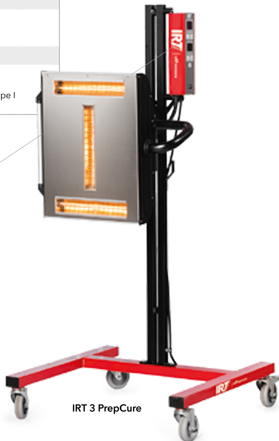
IRT 3 PrepCure