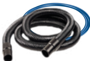
Hose 5 m | Ø 29 mm