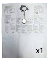
Dust bag ref. 058880 (x5)