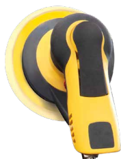
Pneumatic orbital sander with Ø 150 mm buffing pad MIRKA PRO S 650HP ref. 071346