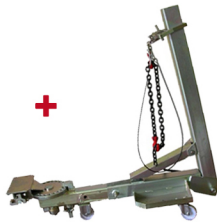
6 TONNE PULL POST