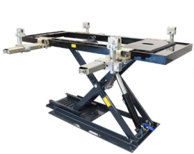
JOLLIFT 1330 BENCH