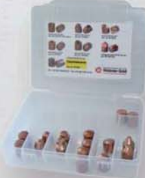
Elektrodes caps set Item N° 497110