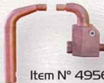
Item N° 495607