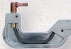
Item N° 495611