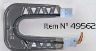
Item N° 495625