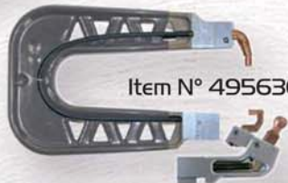
Item N° 495630