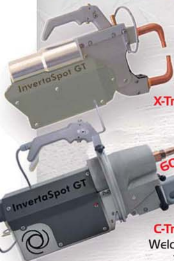
X-Trafo gun option