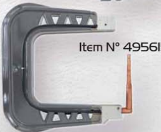
Item N° 495615