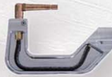
Item N° 495650